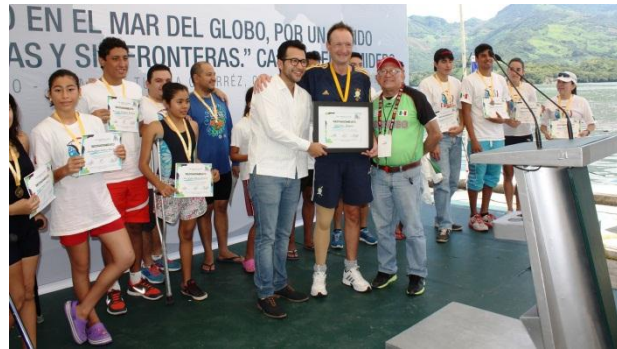
Canyon del Sumidero, MEXICO