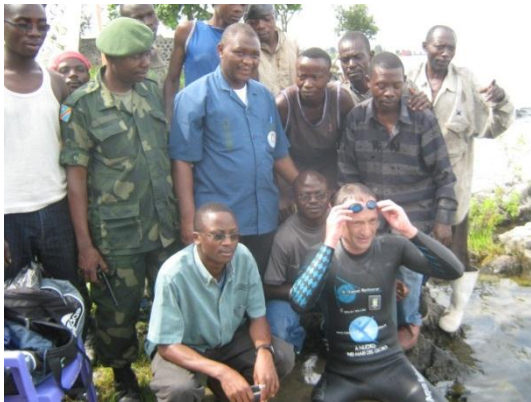
Republica Democratica del Congo